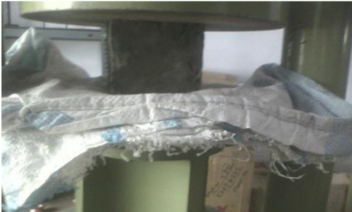
Fig.5. Compressive Strength Test

The cube specimens is of the size 150x150x150mm. if the largest nominal size of aggregate does not exceed 20mm, 10cm size cubes may also be used as an alternative cylindrical specimens have a length equal to twice the diameter.