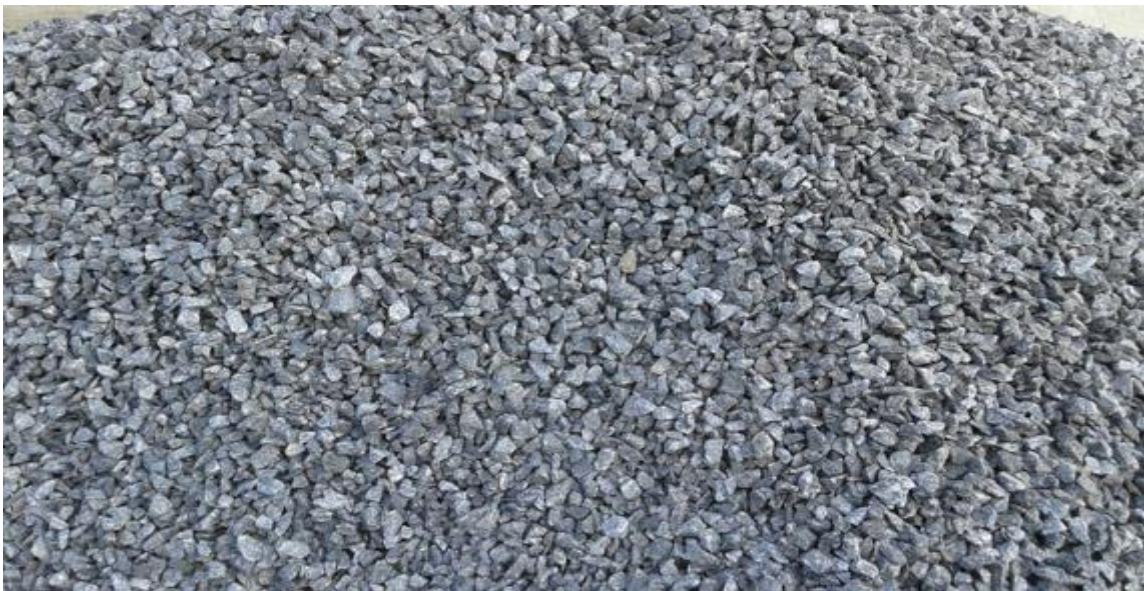
Fig.4. Coarse Aggregate

Aggregate comprises about 55% of the volume of mortar and about 85% volume of mass concrete. The maximum size of aggregate used in this work is 12.5mm. Aggregates which is passed through 4.75 IS sieve is termed as fine aggregate. Fine aggregate is added to concrete to assist workability and to bring uniformity in mixture. Usually, the natural river sand is used as fine aggregate.