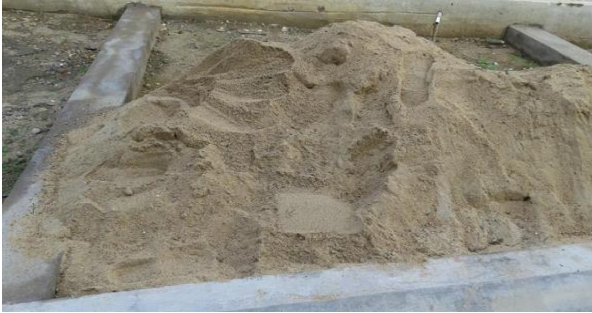
Fig.3. Fine Aggregate

Aggregate comprises about 55% of the volume of mortar and about 85% volume of mass concrete. The maximum size of aggregate used in this work is 12.5mm. Aggregates which is passed through 4.75 IS sieve is termed as fine aggregate. Fine aggregate is added to concrete to assist workability and to bring uniformity in mixture. Usually, the natural river sand is used as fine aggregate.